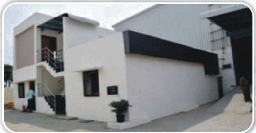
SAMAN ENGINEERING & TECHNICAL SERVICES PVT LTD., - MANNUR. Size 21.00m Span Area 3720.00.00 Sq.m