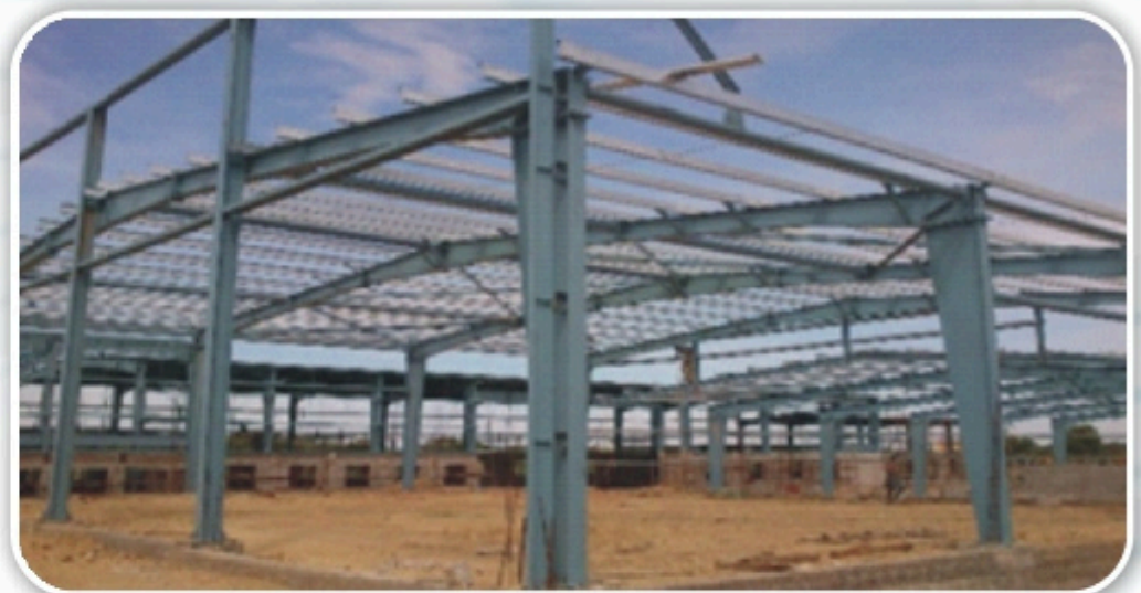
SJB AUTOMOBILES PVT LTD., - Naga Mangalam Showroom with Workshop.