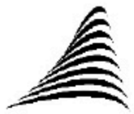
NISSAN - SJB AUTOMOBILES PVT LTD., - PANJAPUR , TRICHY Showroom with Workshop.