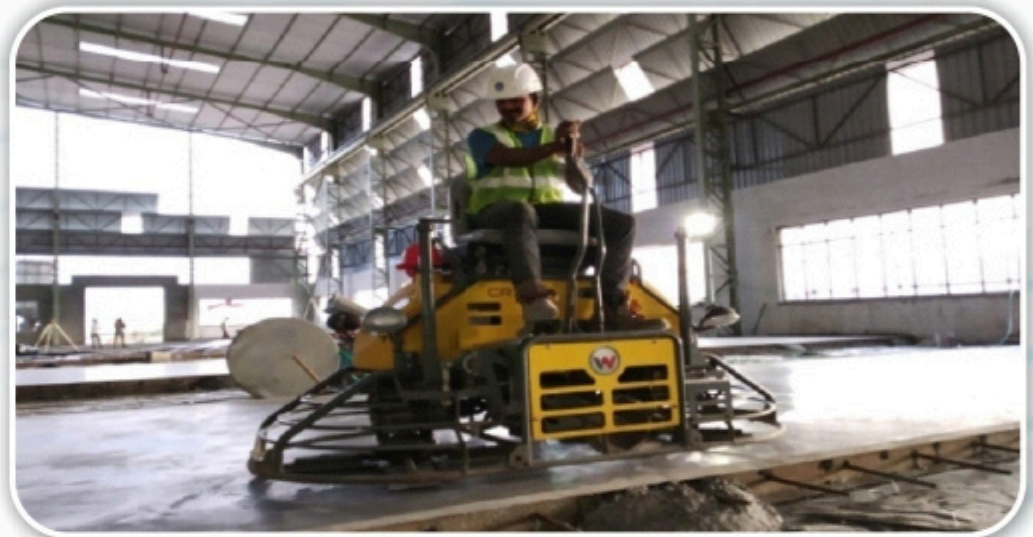
RANE TRW STEERING SYSTEMS PVT LTD., PUDUKOTTAI. Size 50.00m Span Area 3500.00 Sq.m