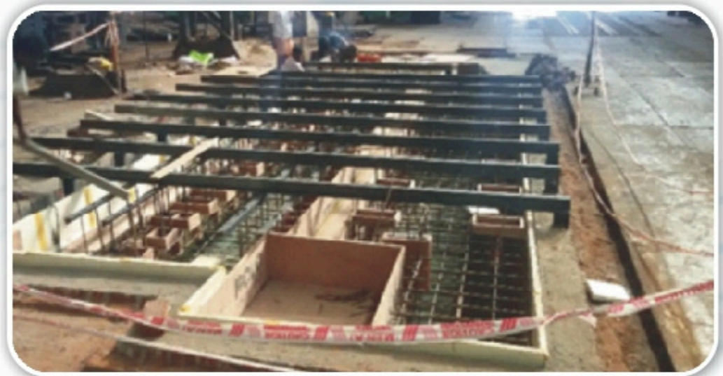
2000 TON PRESS- MM FORGINGS LTD., VIRALIMALAI